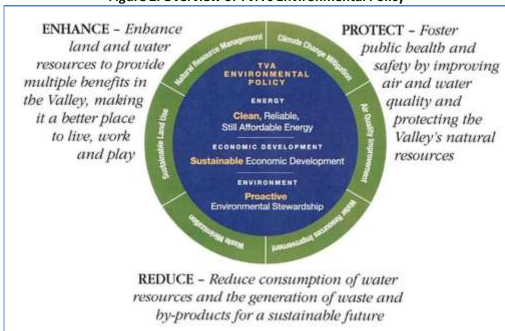
Figure 2: Overview of TVA's Environmental Policy

TVA will lead in reducing the environmental impact of its operations {including procurement, acquisition, real property or leasing decisions} and in protecting and enhancing the Valley's natural resources.