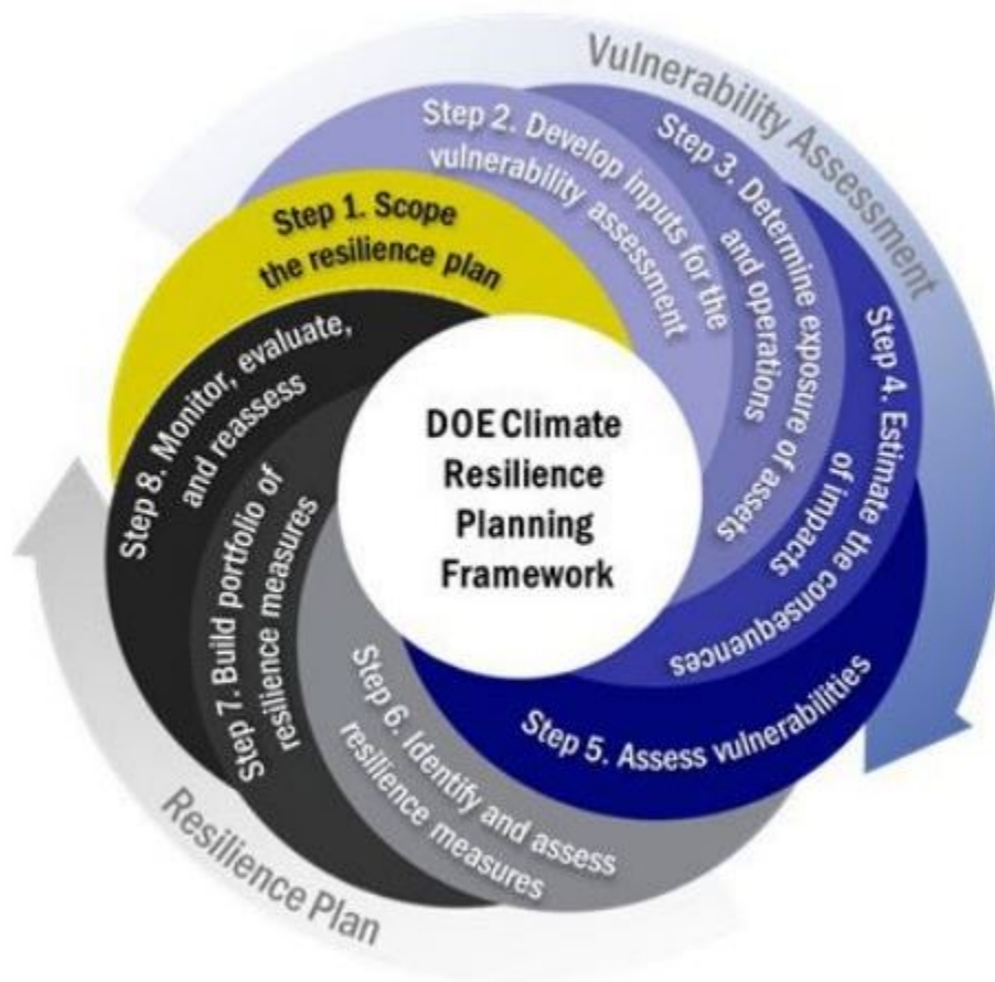
Figure 1. Planning Framework

The Planning Framework provided in this Plan is intended to equip TVA planners with the analytical framework, references, tools and other guidance to: